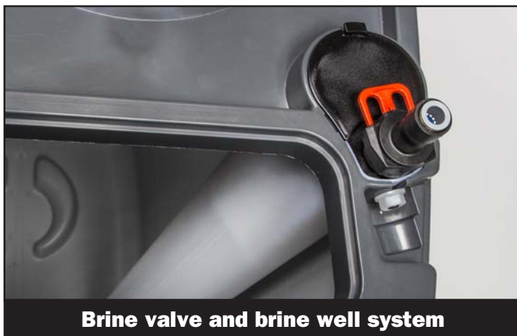
Brine valve and brine well system