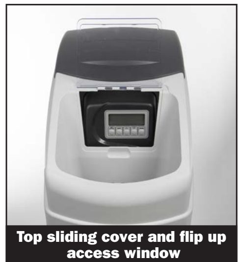
Top sliding cover and flip up access window