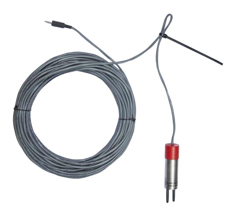
FIG 2 Probe with Suspension Clip