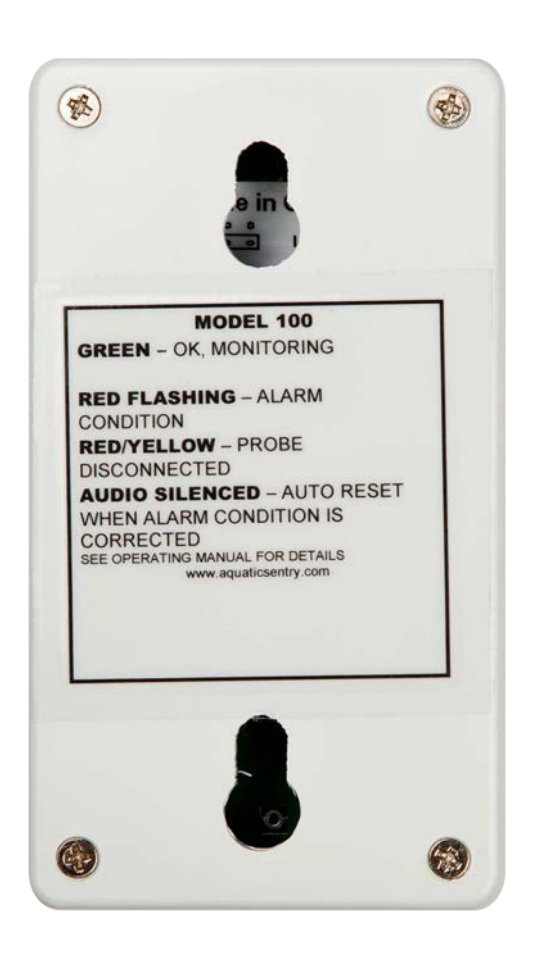
FIG 4 Indoor Alarm Display Rear Label