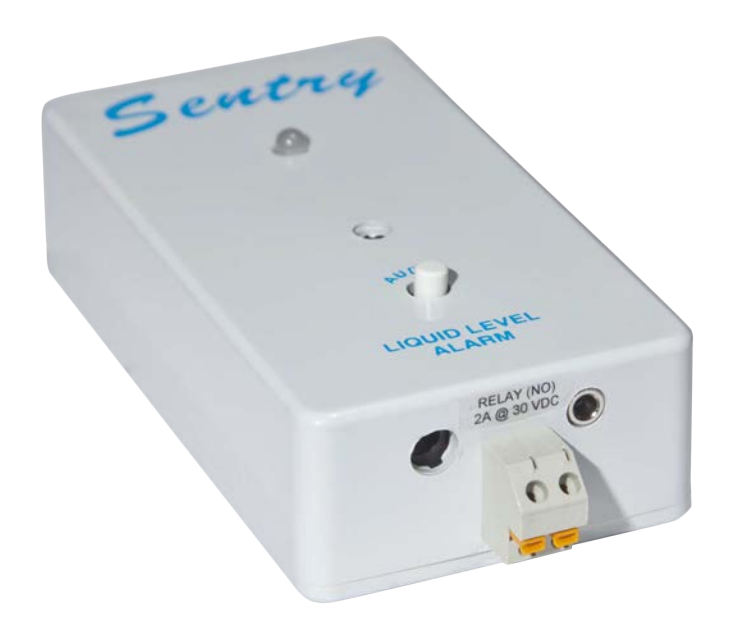
FIG 3 Relay Option

The relay output may be used to switch an external circuit to operate remote alarms, security systems, autodialers or other control applications. The spring clamp terminal block on the indoor display accepts 26-14 gauge solid or stranded wire. See Fig 3 below. Depress the orange lever and insert the stripped wire into the terminal block.